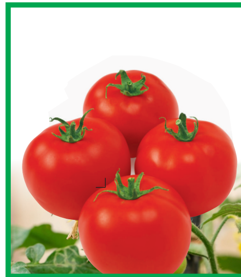
HYBRID TOMATO SK-9036