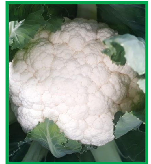
HYBRID CAULIFLOWER SK-078 SHASHI