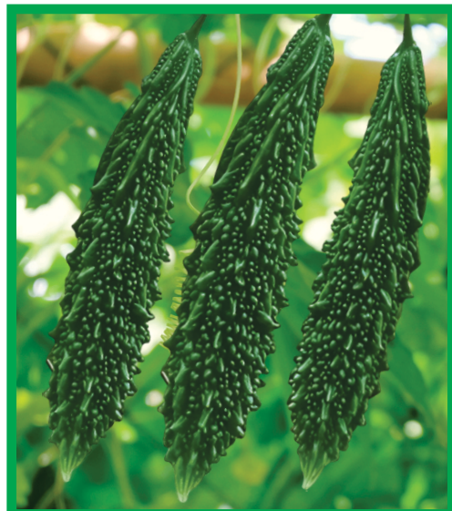
HYBRID BITTER GOURD SK-306