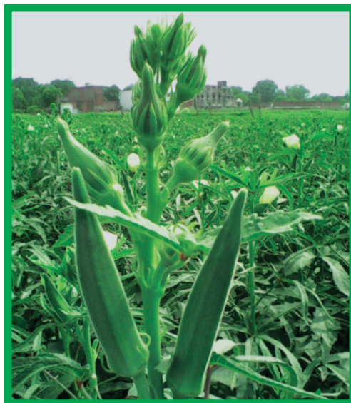
HYBRID BHINDI SK 119 CHAMAN