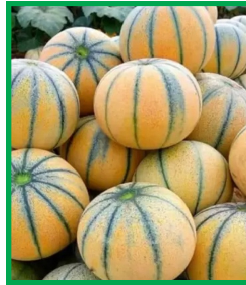
HYBRID MUSK MELON SK-01 SARANG