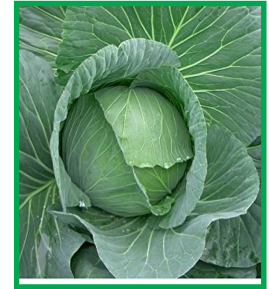
HYBRID CABBAGE SK-809