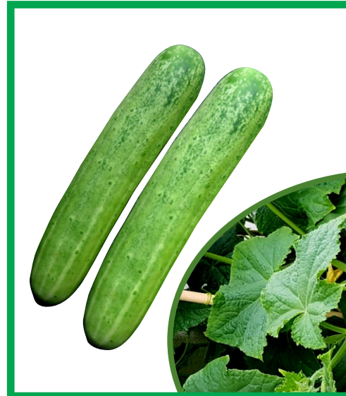
HYBRID CUCUMBER SK-8073