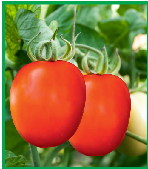
HYBRID TOMATO SK-9045