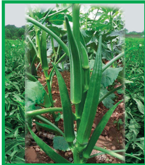
HYBRID BHINDI SK 121 RAFALE