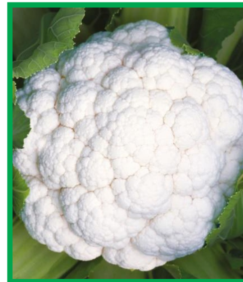
HYBRID CAULIFLOWER SK-607 JARA