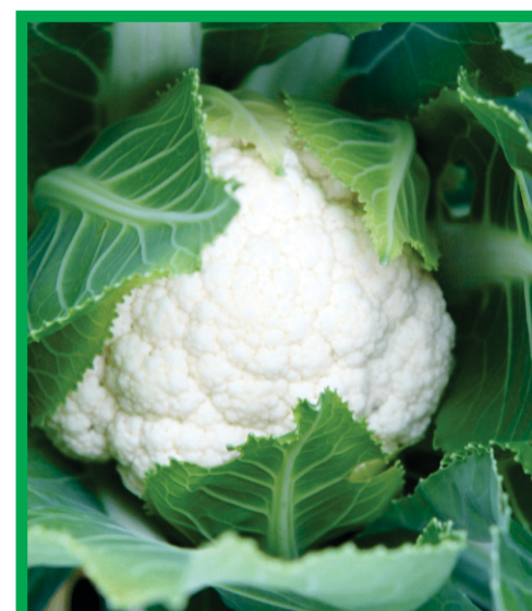
HYBRID CAULIFLOWER SK-910 SWATHI