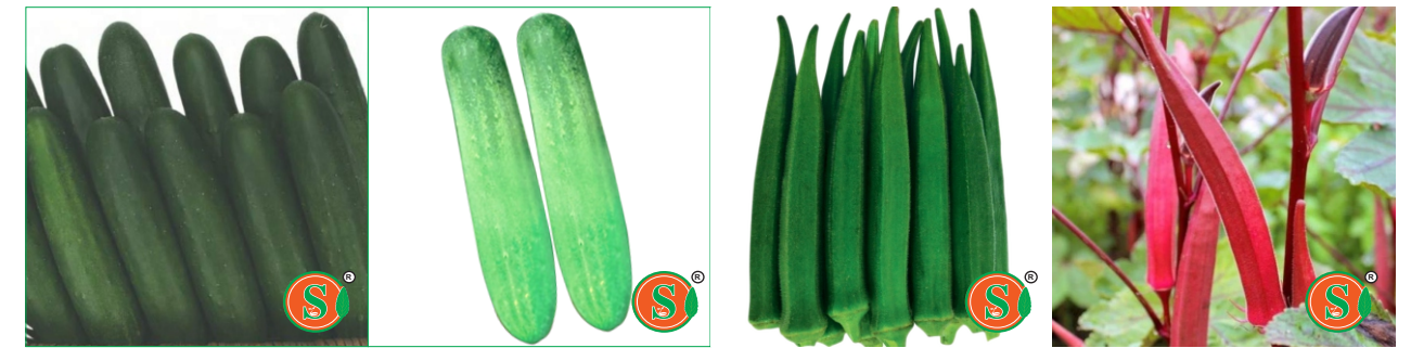
HYBRID CUCUMBER SK 8098 CUCUMBER SKR PARI BHINDI SKR 21 HYBRID BHINDI SK - LALIMA