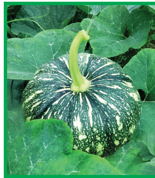
HYBRID PUMPKIN SK-765 NITAL