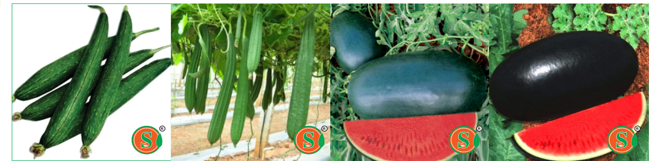
HYBRID SPONGE GOURD SK6003 DEEPIKA HYBRID RICH GOURD SK-6602 HYBRID WATERMELON SK SINGAM HYBRID WATERMELON SK TEJAS