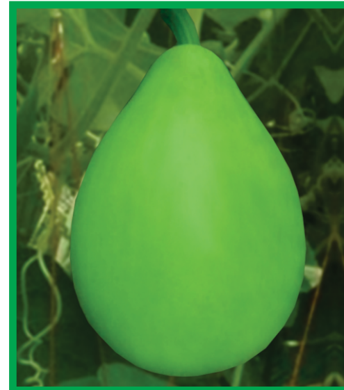
HYBRID BOTTLE GOURD SK 228