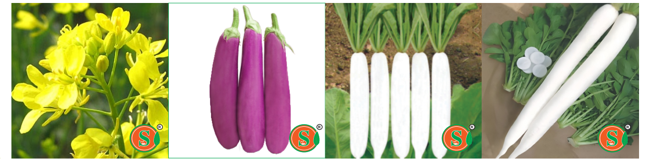
HYBRID MUSTARD SK-01 NEETA HYBRID BRINJAL SK-408 RADISH PALKI 35 (PALAK PATTA) HYBRID RADISH SK 448 MEG