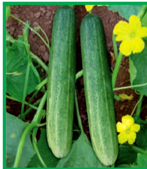
HYBRID CUCUMBER SK NEHA