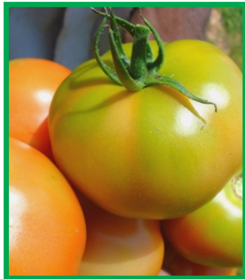
HYBRID TOMATO SK-678