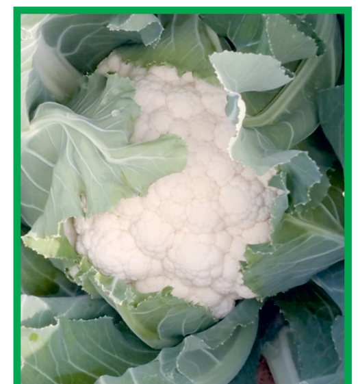
HYBRID CAULIFLOWER SK-911 SNEHA