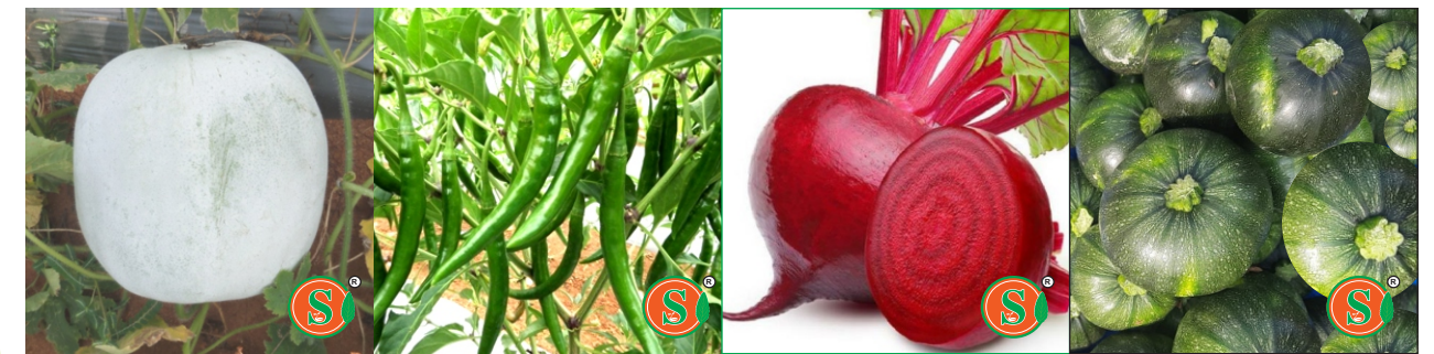
HYBRID ASH GOURD SK-104 HYBRID CHILLI SK-2245 HYBRID BEET ROOT SK-Lalita HYBRID SQUASH SK-LUCKY