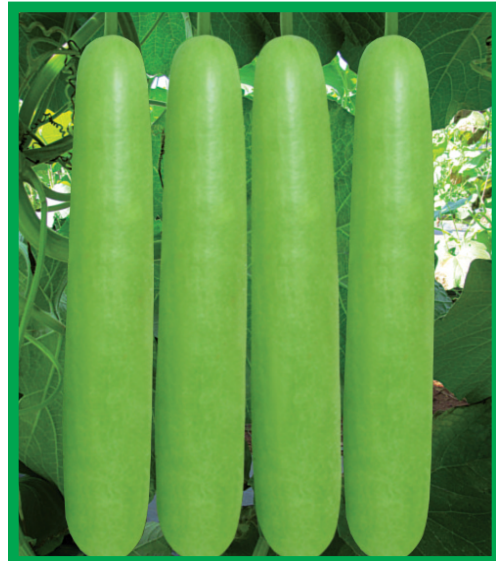
HYBRID BOTTLE GOURD SK-216 SONAM