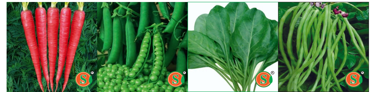
CARROT SK-90 PEAS SK-11 PALAK ALL GREEN COWPEA SK-07 SEVEN STAR