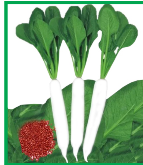
HYBRID RADISH SK - SUPER-30